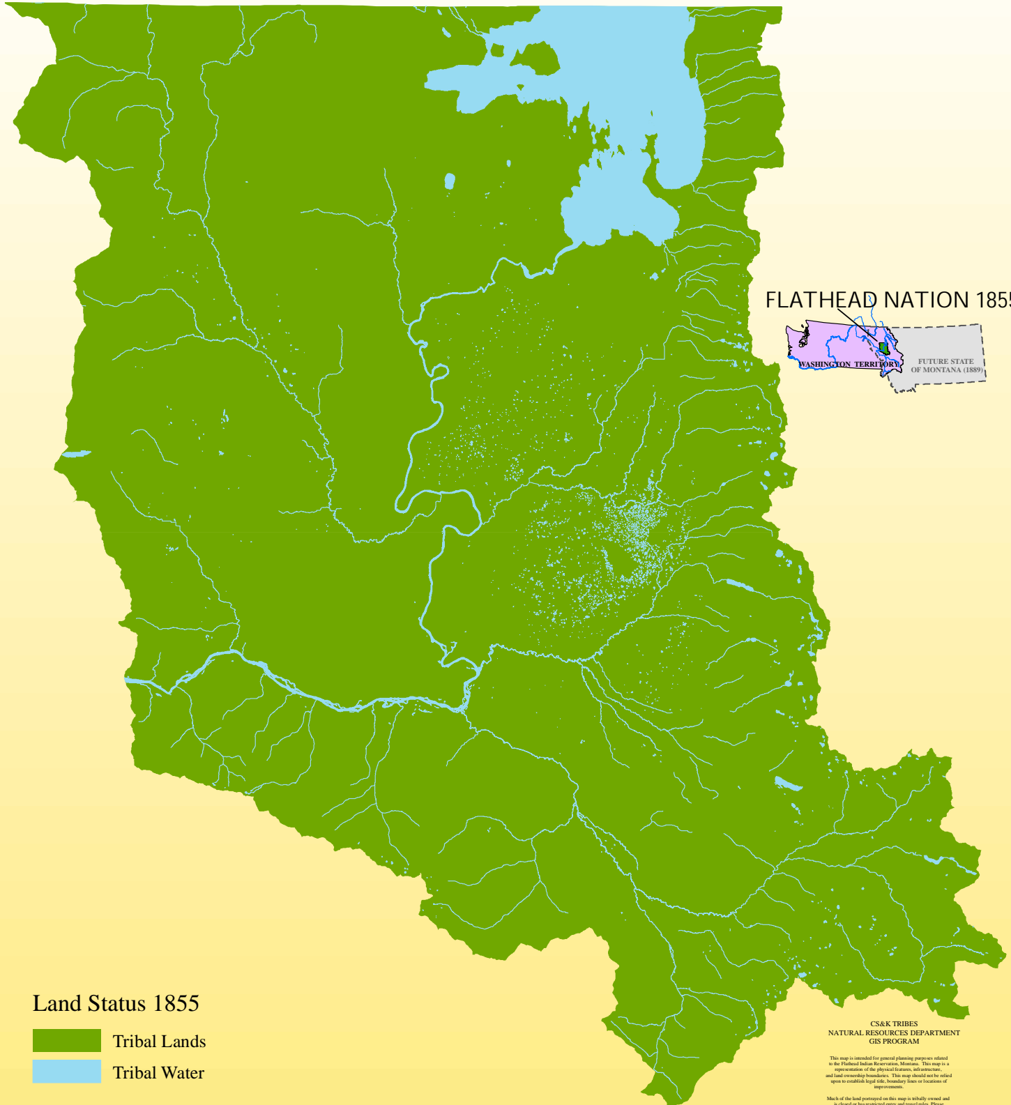
FLATHEAD NATION 1855